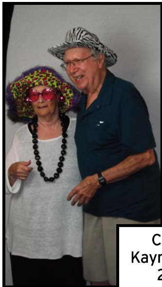
Camp Kayne Hora 2011